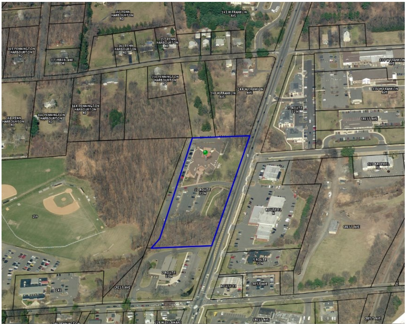
Photo Showing Existing Sign Location / To Be Replaced